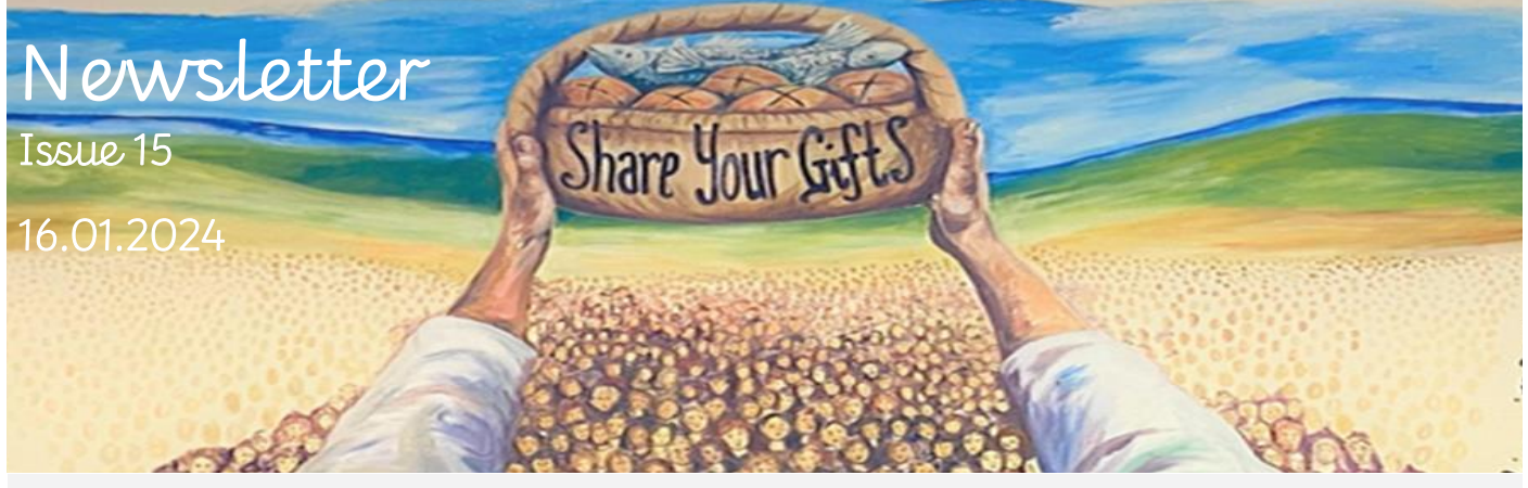
Our school blog

This week we had our termly visit from the Education Welfare Officer (EWO) who supports the school in all attendance queries. She reported to us that our current absenteeism rates are well below the national average and is one of the best in the local area.