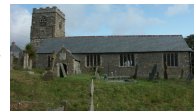
St. Sampson church