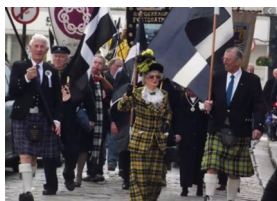
Celebrating St. Piran's day