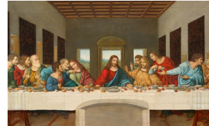
The Last Supper