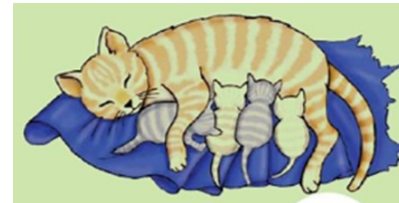
Stories about the Prophet Muhammad