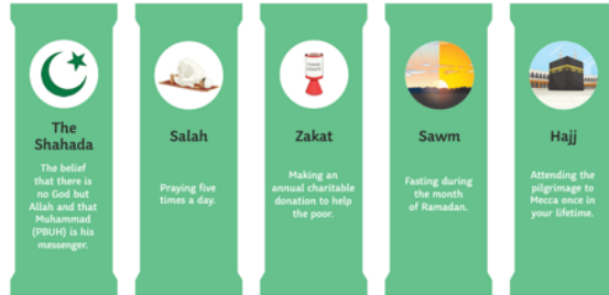
Shahadah and Salah (2 of the 5 pillars of Islam)