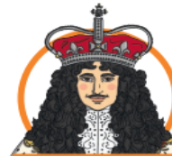
King Charles II