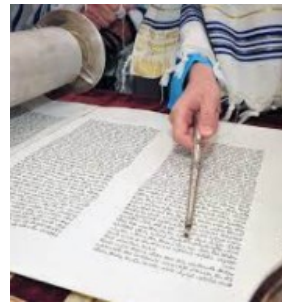
Torah scroll and yad

Why is a Mezuzah on the doorpost? What is inside the case?