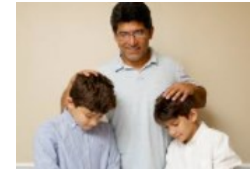
A prayer of blessing

Shabbat is the Jewish day of rest. Jewish people believe G-d created the world and rested on the 7th day, and they follow this example and have a day of rest every week.