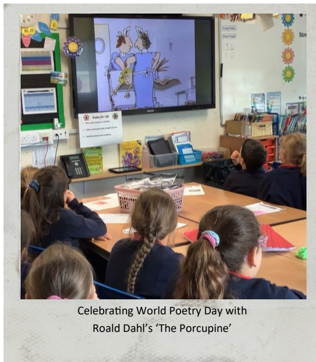
Celebrating World Poetry Day with Roald Dahl's 'The Porcupine'