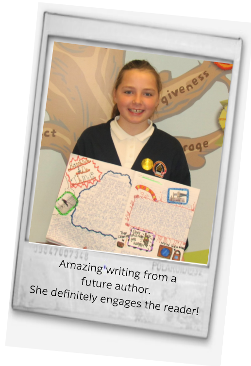
Amazing writing from a future author. She definitely engages the reader!