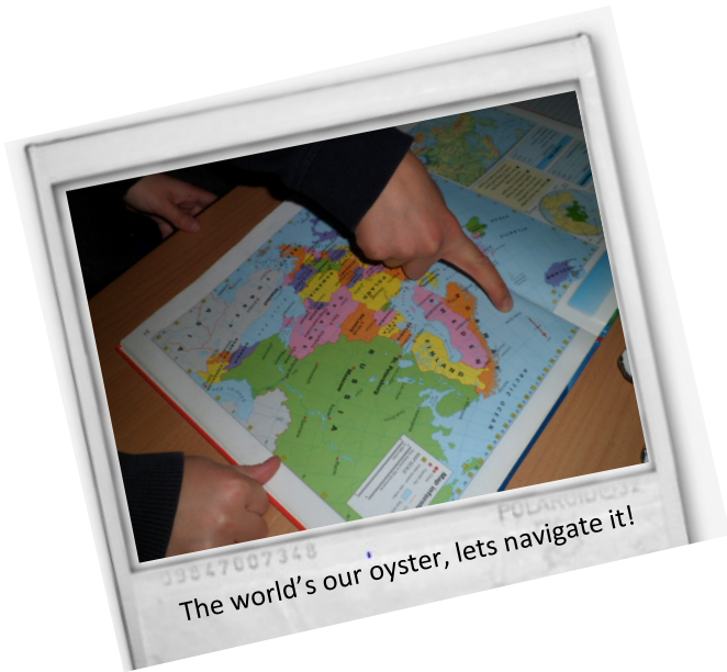
The world's our oyster, lets navigate it!