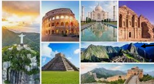
The Seven Wonders of the World