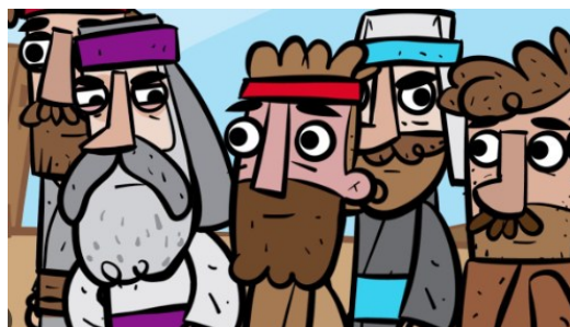
The Pharisee and the Tax Collector