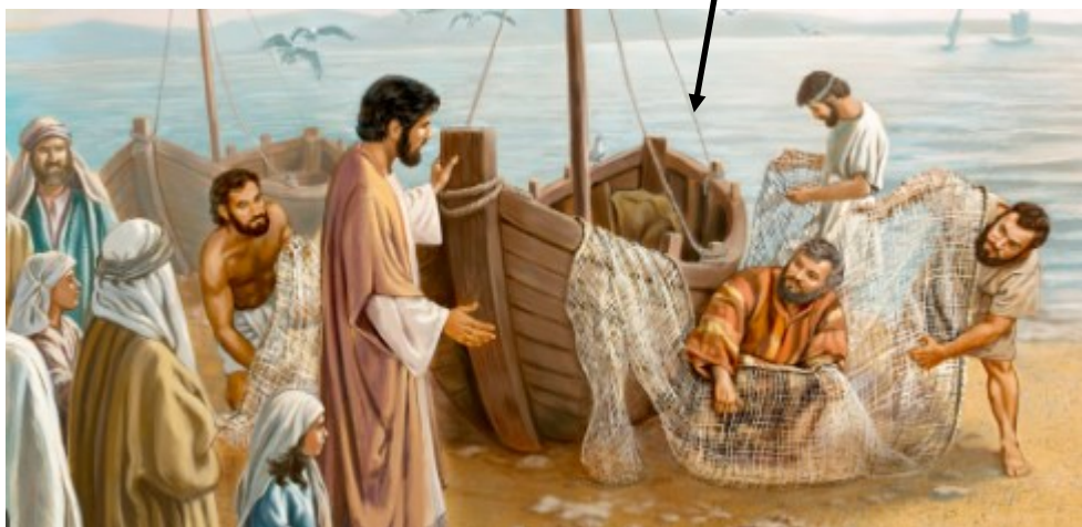
The Calling of the First Disciples